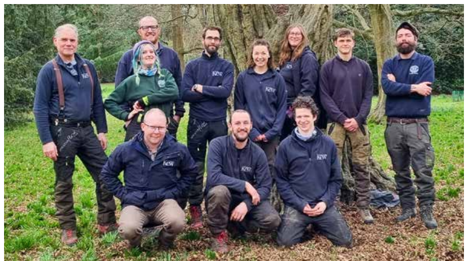
Tree Teams from the University of Oxford Botanic Garden & Arboretum and the Royal Botanic Gardens, Kew