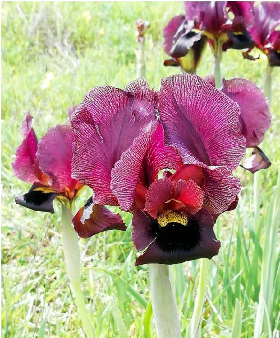
Iris atropurpurea in Israel

On behalf of the horticultural team I thank you for your valued support and we look forward to welcoming you to the Garden this summer.