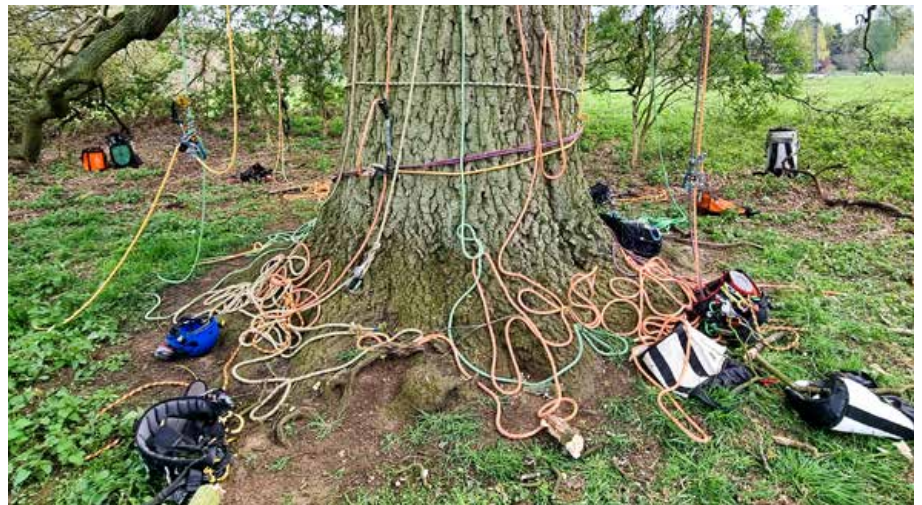
Setting up ropes on three-day advanced tree climbing training course

I look forward to developing as an Arborist over the next two years at the Arboretum, and I am particularly excited to begin climbing trees and to improve my identification of the ornamental trees in the collection.