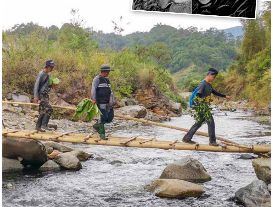
Field work in Kalinga