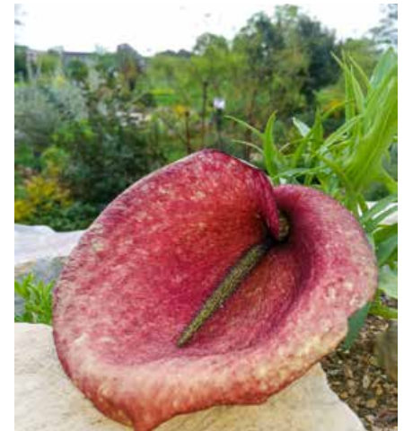
Helicodictyon muscivorus in flower in the Rock Garden