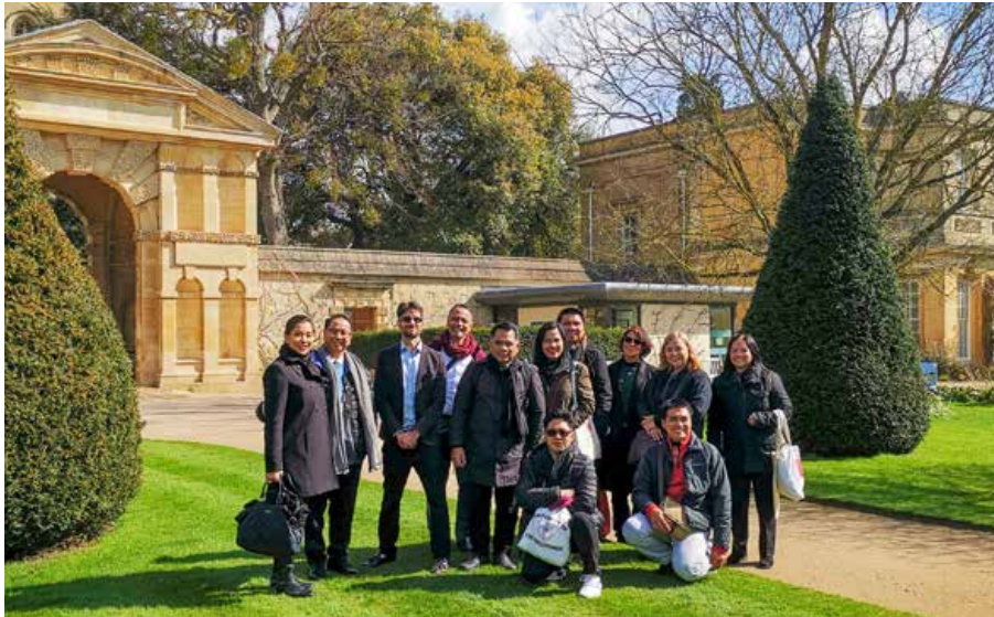
The delegation from the University of the Philippines at OBG in early April

After a two-year absence due to the pandemic, the ancient tradition of May Morning made a spectacular return to the city this year. Despite the dry spring, the Botanic Garden looked beautiful on May 1st, and hundreds enjoyed a view of Magdalen Tower framed by bowers of handkerchief tree, assertive red sprouts of rheum, and splashes of colour in the taxonomic beds. Meanwhile, a few miles down the road, a blue haze settled over the Arboretum as the native bluebells unfurled.