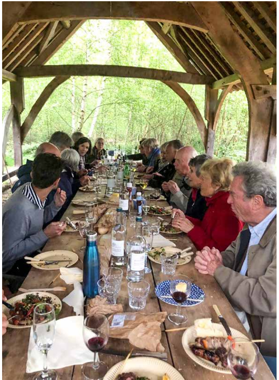
A feast in the Barn!