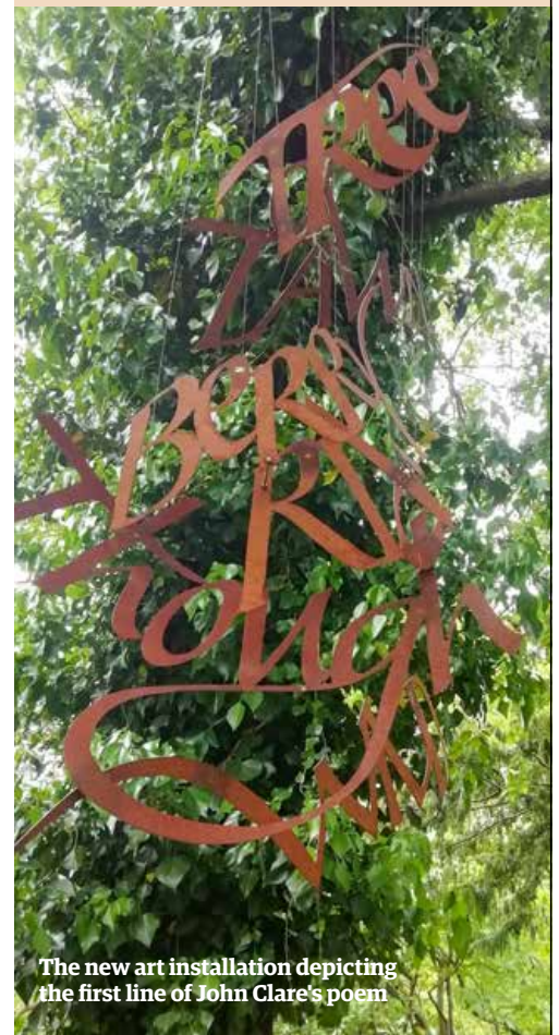
The new art installation depicting the first line of John Clare's poem