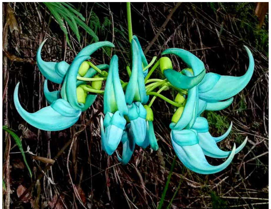
A species of jade vine ( Strongylodon elmeri )