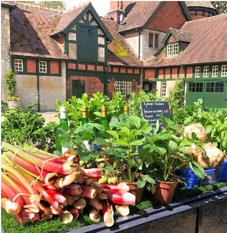
Produce for sale at Eythrope

Do consider joining us. Our loyal Patrons provide extra financial backing to support the valuable work of the Botanic Garden and Arboretum. Our members, and the Danby Patrons' Group, enjoy all the benefits of the Friends plus a programme of small group visits to the University collections and to some of the best gardens and estates in the area. We aim to visit as wide a range of gardens as possible in terms of style, size and location and are very grateful to all those who welcome us to their own creative realms.