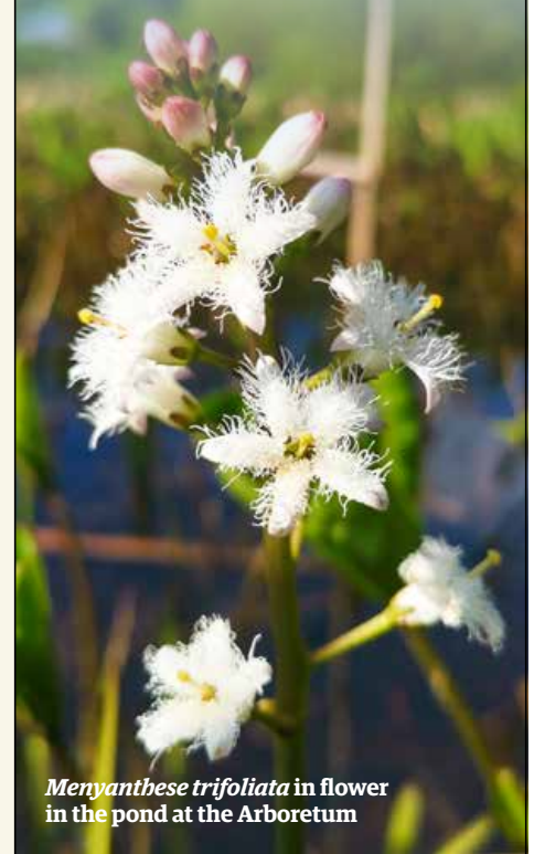
Menyanthes trifoliata in flower in the pond at the Arboretum

This process will take some time, as legal and other issues are settled. However, the Bodleian has recently led the way, so that we will be able to follow in what I hope will not be too onerous a process. If you have any questions about this, please do email me via the Administrator ( friends.administrator@obg.ox.ac.uk ).