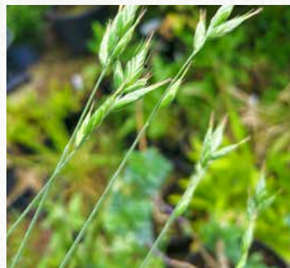
Bromus interruptus in flower at OBG

Freshwater Habitat Trust's 'Gro Wet' is garnering community support with upwards of two hundred volunteers stepping forward; they will play an important role in distributing and establishing plants in dedicated reserves around Oxford.