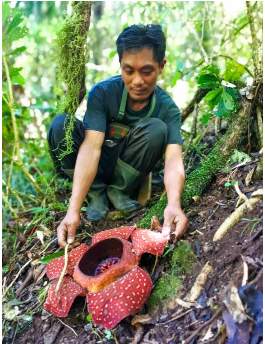
A member of the Banao Indigenous Community with Rafflesia banaoana

We drove north to the Sierra Madre where the University of the Philippines owns a Land Grant - an extensive tract of rainforest with enormous potential for research, conservation, and public engagement. After giving an online seminar in the offices, I was taken into the forest to see the native flora. We pushed our way through spiny