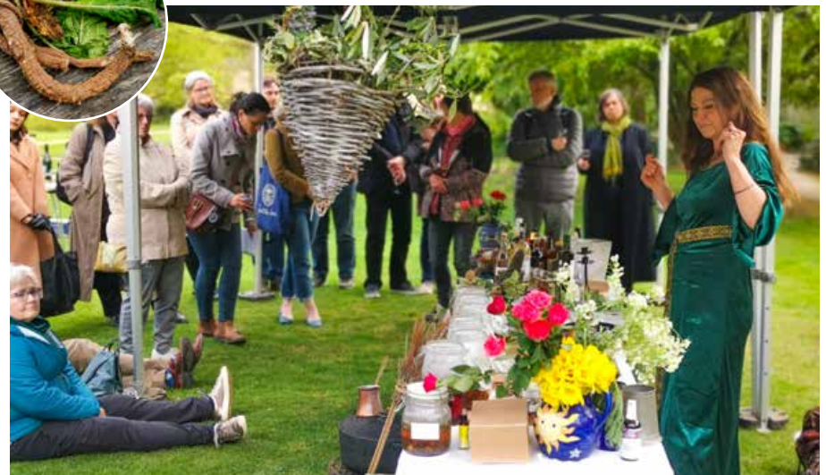
A talk about Herbal Medicine in the time of Shakespeare. Insert: A freshly harvested mandrake