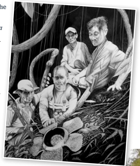
An illustration of the Banao Indigenous Community with Rafflesia banaoana

in Kalinga Province - a remote wilderness that, besides my colleagues, no one I had met on the expedition so far, had ever been close to. It took days to drive there. In the forest we met the Banao Indigenous Community: they and they alone knew how to reach our target: Rafflesia banaoana - a plant, I was told, I would be the third botanist and first Westerner, ever to set eyes on. With the help of the tribe, we bored into the very depths of the pathless forest, battling with stinging vines and leeches, to reach the site. We crossed a river and entered a densely forested slope where dozens of the giant flowers were quietly unfurling. I can say with sincerity that this was the most extraordinary experience of my life, and it brought tears to my eyes.