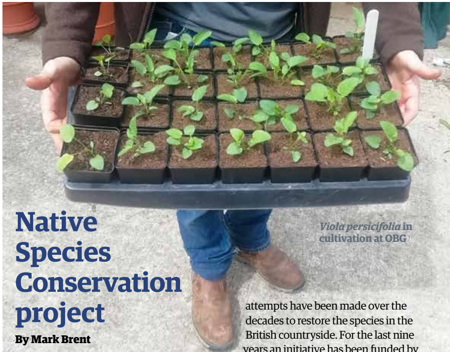
Viola persicifolia in cultivation at OBG