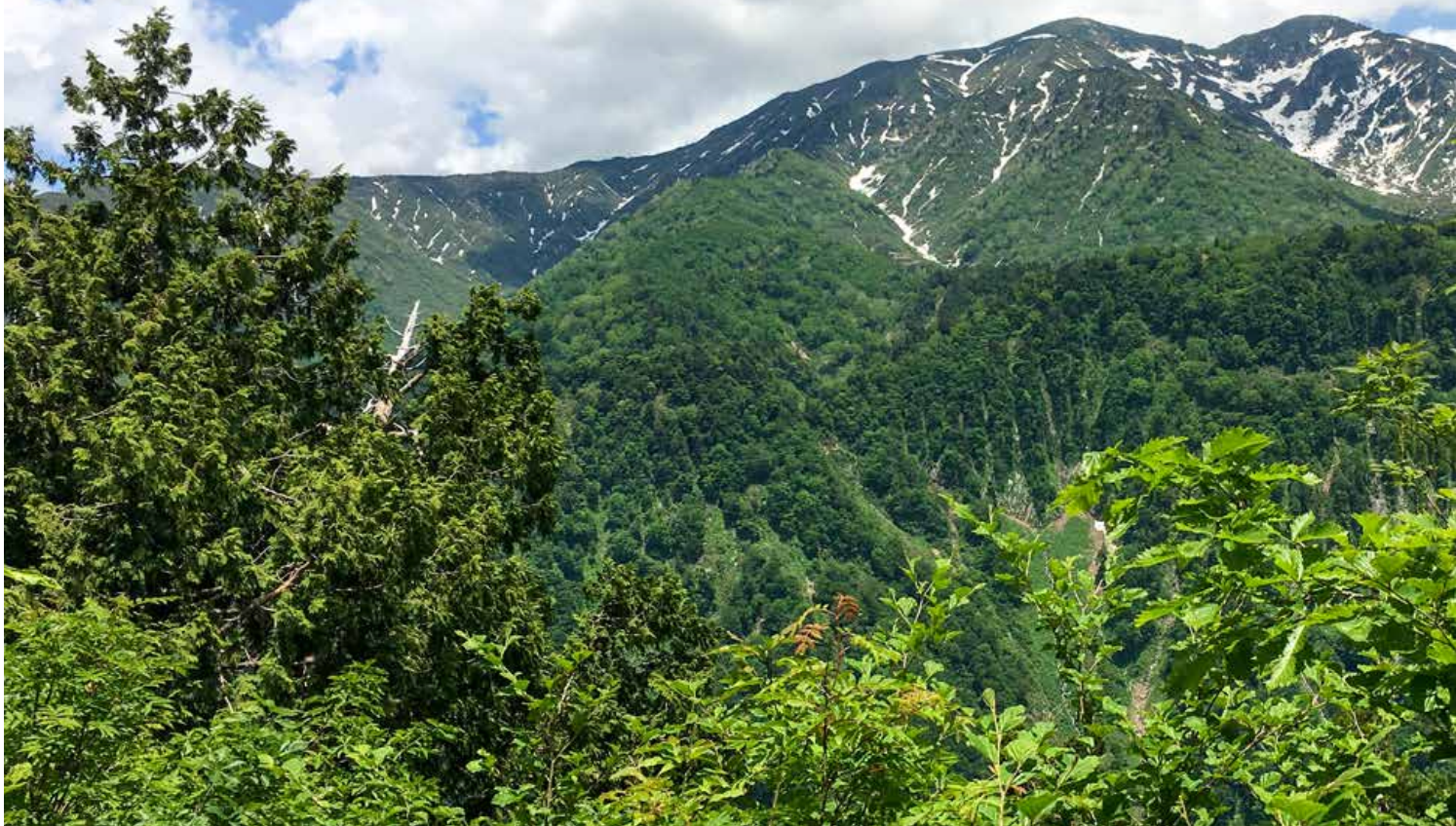
Mount Tateyama, Toyama Prefecture, Japan

we have been developing a unique plant collection at the Arboretum to display the extraordinary plant diversity of Mount Tateyama. As the new plantings establish, this collection will reflect the rich diversity of plants that grow on the mountain, including Magnolia obovata , Euptelea polyandra , Cercidiphyllum japonicum ,