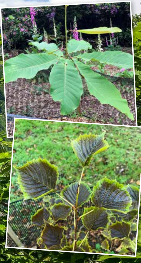
Magnolia obovata and Euptelea polyandra

The first phase of planting has been completed, and the Mount Tateyama Collection will offer visitors a tranquil setting in which to experience and be inspired by some of the fascinating plants that occur in this biodiverse part of the world.