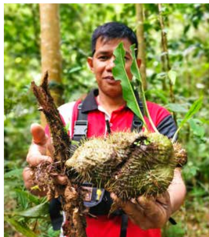
An ant plant, found in the forests of the Land Grant in the Sierra Madre